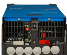
MultiPlus 2000 VA (bottom cover removed)