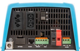
MultiPlus 500 / 800 / 1200 / 1600 VA